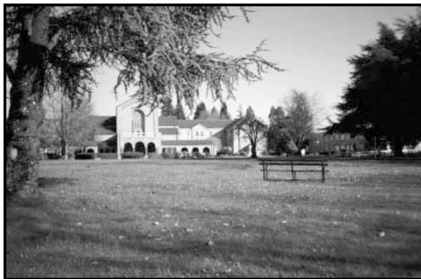
Mount Angel Abbey and Seminary, on the hill, in Benedict Oregon.